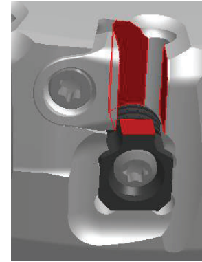
Fig1, Cleaning area