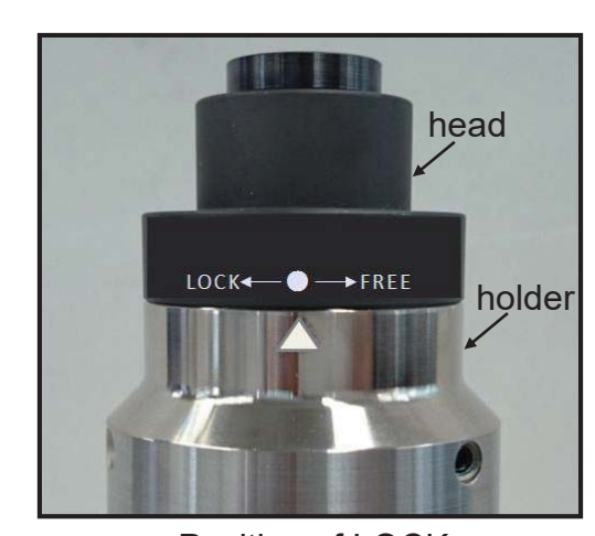
Position of LOCK