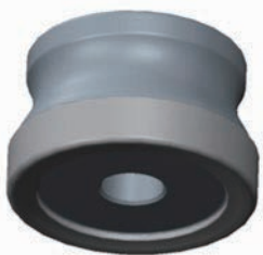
3D simple model (STEP) example